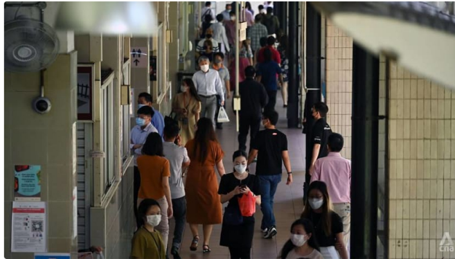
People wearing face masks while buying food from Amoy Street Food Centre on Jul 22, 2021.

08 Sep 2021 06:34PM (Updated: 09 Sep 2021 09:08AM)